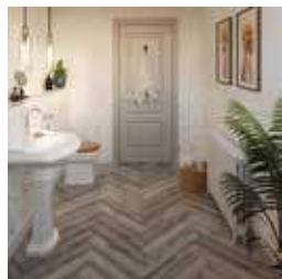
Haldon Antique Oak Herringbone Page 17