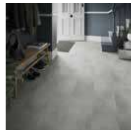
Axia Concrete Grey Tiles Page 23