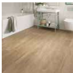
Warm Maple Planks Page 11