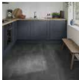
Pinnacle Concrete Anthracite Tiles Page 28