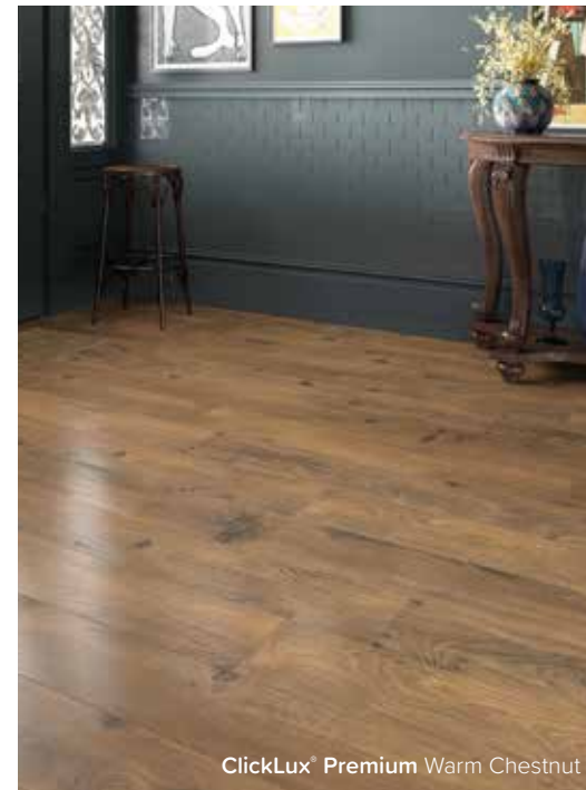
ClickLux® Premium Warm Chestnut