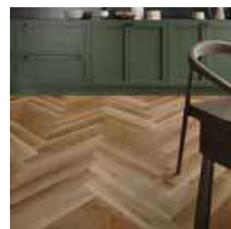
Burnham Golden Oak Herringbone Page 18