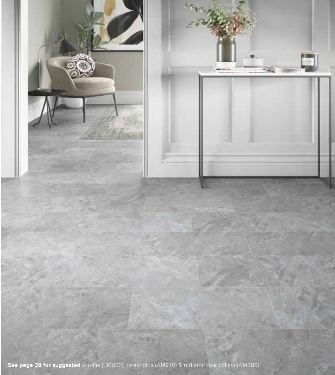
See page 38 for suggested scotias (L10093), thresholds (A14270) & radiator pipe collars (A14280)