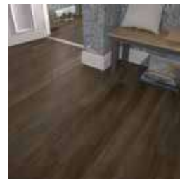
Rich Walnut Planks Page 15