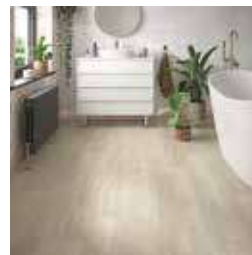
Limed Oak Planks Page 9