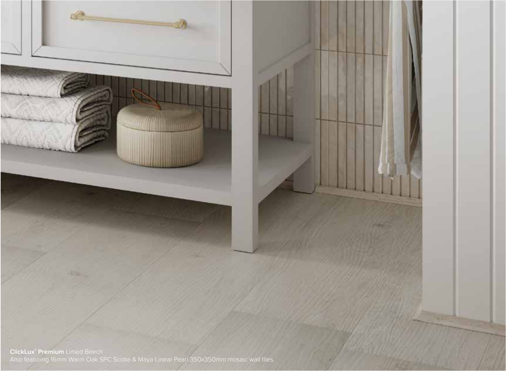
ClickLux® Premium Limed Beech Also featuring 16mm Warm Oak SPC Scotia & Maya Linear Pearl 350x350mm mosaic wall tiles.