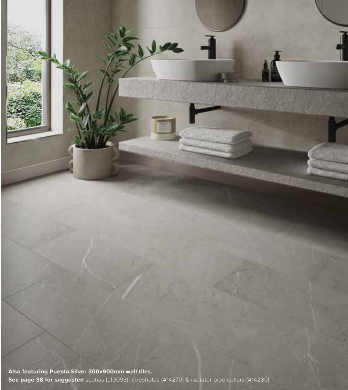
Also featuring Pueblo Silver 300x900mm wall tiles. See page 38 for suggested scotias (L10093), thresholds (A14270) & radiator pipe collars (A14280)