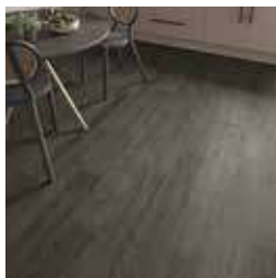
Black Elm Planks Page 7