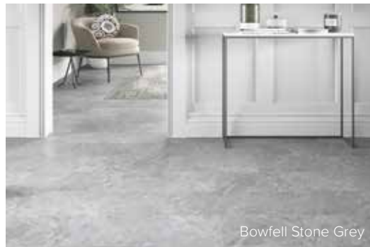
Bowfell Stone Grey

*See installation advice on pages 40-41 for further information and technical specification