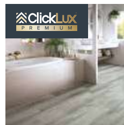
Ash Grey Premium Plank Page 32