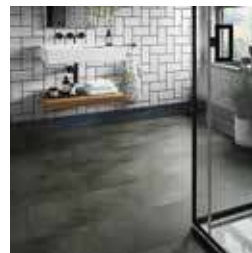
Axia Concrete Anthracite Tiles Page 22