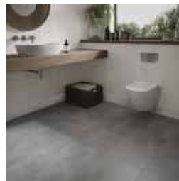
Pinnacle Concrete Grey Tiles Page 29