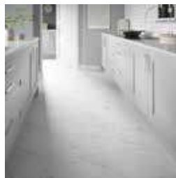
Castello Marble White Tiles Page 25