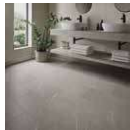
Rodellar Stone Silver Tiles Page 27