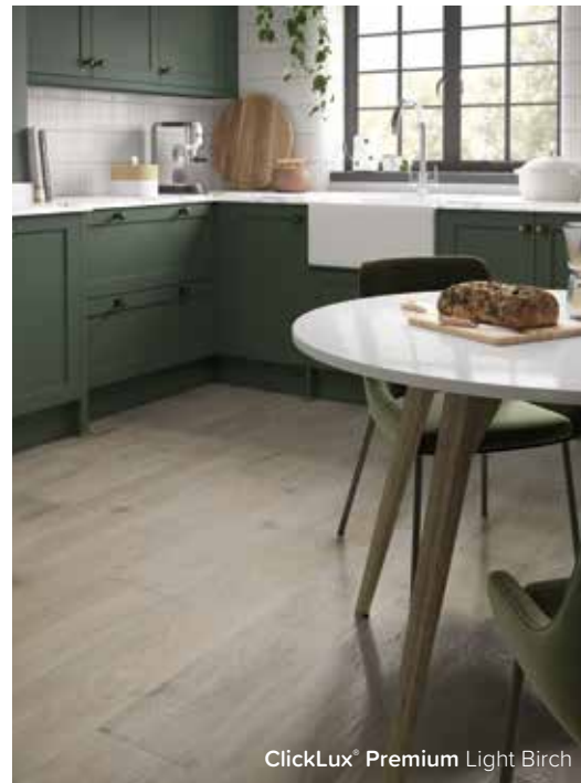
ClickLux® Premium Light Birch

*See installation advice on pages 40-41 for further information and technical specification