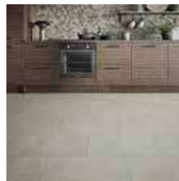
Chamonix Marble Beige Tiles Page 24