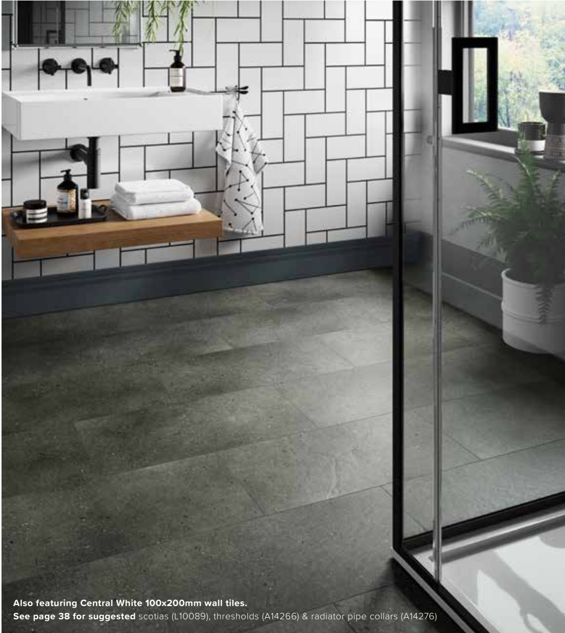
Also featuring Central White 100x200mm wall tiles. See page 38 for suggested scotias (L10089), thresholds (A14266) & radiator pipe collars (A14276)