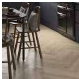
Selwood Light Oak Herringbone Page 20