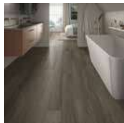
Antique Cedar Planks Page 12