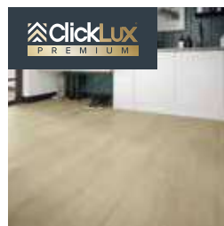
Light Oak Premium Plank Page 34