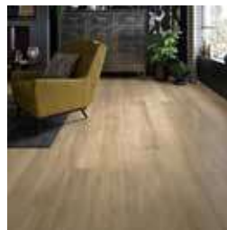
Light Oak Planks Page 10