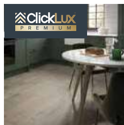
Light Birch Premium Plank Page 33