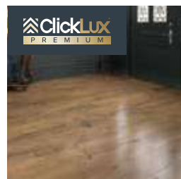
Warm Chestnut Premium Plank Page 37