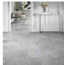
Bowfell Stone Grey Tiles Page 26