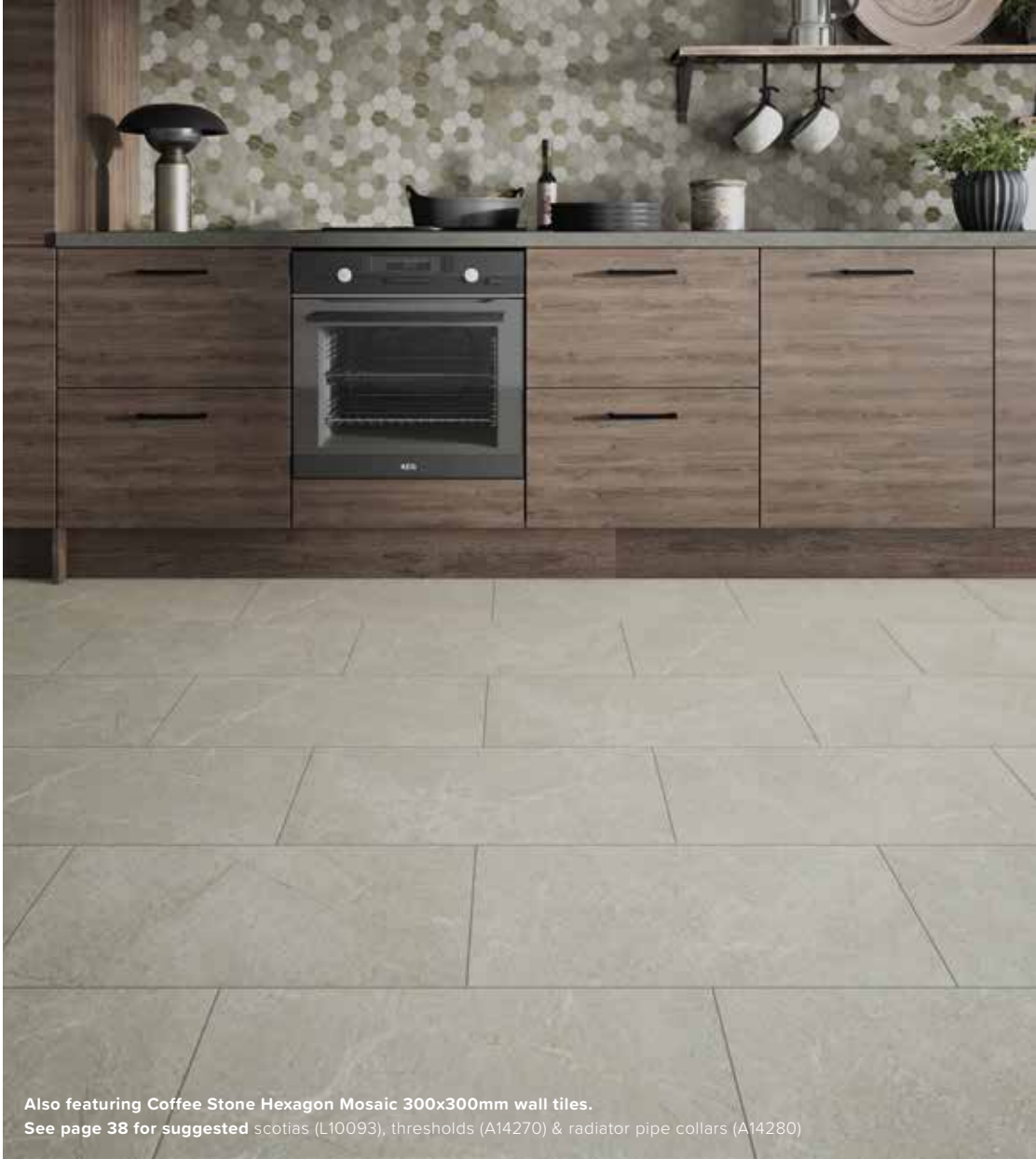
Also featuring Coffee Stone Hexagon Mosaic 300x300mm wall tiles. See page 38 for suggested scotias (L10093), thresholds (A14270) & radiator pipe collars (A14280)