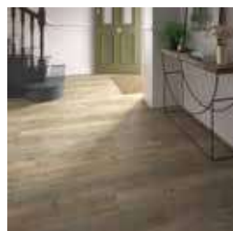
Rustic Willow Planks Page 13