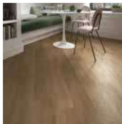
Golden Beech Planks Page 14