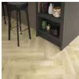
Rydal Natural Oak Herringbone Page 19