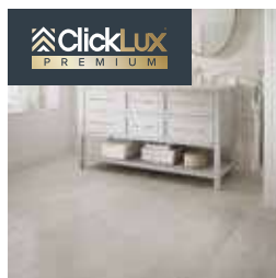
Limed Beech Premium Plank Page 35