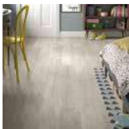
Silver Birch Planks Page 6