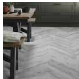
Wyre Silver Oak Herringbone Page 16