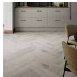
Ashdown Limed Oak Herringbone Page 21