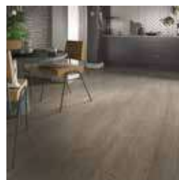
Weathered Ash Planks Page 8